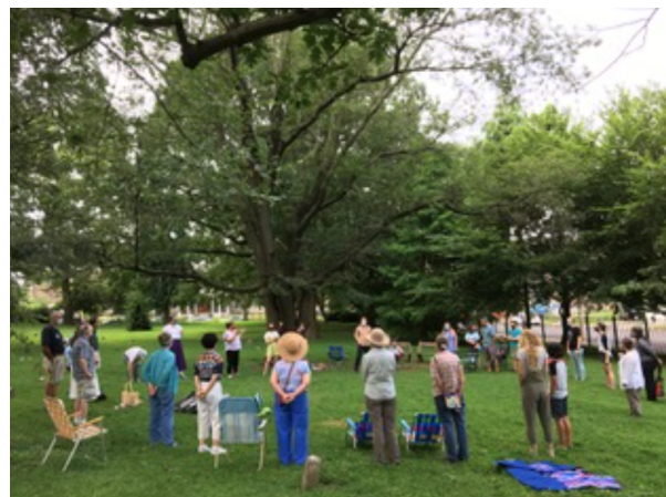
PYM Friends visited Historic Fair Hill at the start of the 2021 Annual Sessions.